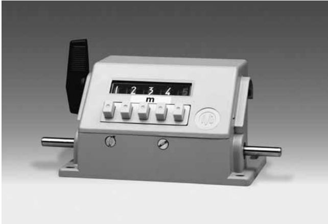
ME230 - Meter counter