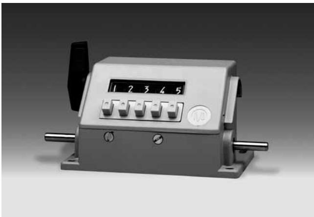
UE230 - Revolution counter